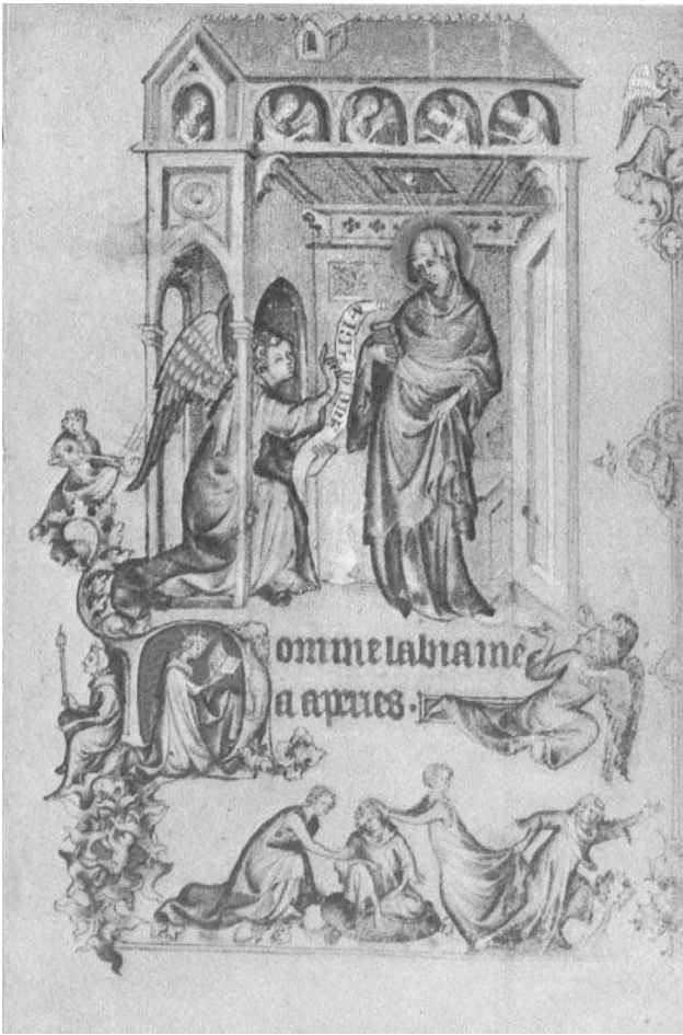
Figure 6. Hours of the Virgin (Matins) (The Hours of Jeanne d'Évreux): the Annunciation with scenes of the buffeting game in bas-de-page (Avril 1978)

In summary, in the book of hours many different temporal and narrative frames are juxtaposed. Each section corresponds to an hour in a day; the textual excerpts provide snapshots of key religious events while the large miniatures expand the temporal framework to more extended and overarching spans (e.g., the entire life of the Virgin). Moreover, the marginal images take the reader through further temporal planes: the release of time into eternity (as in the Apocalypse narrative), and the existential time of one's own life (as in the allegorical images and proverbial representations). The reader is thus invited to follow all of these different