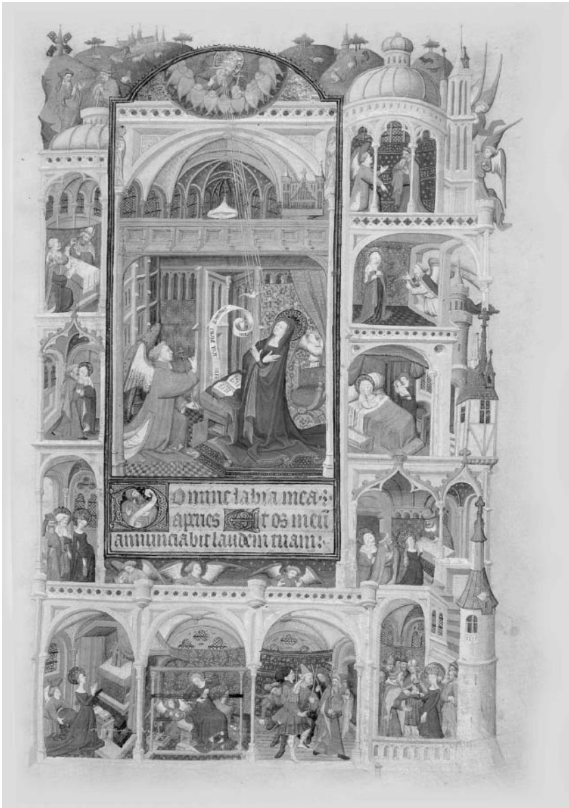
Figure 3. Hours of the Virgin (Matins) (Bedford Hours): the Annunciation, with scenes from the early life of the Virgin Mary (folio 32 r) (Backhouse 1990)