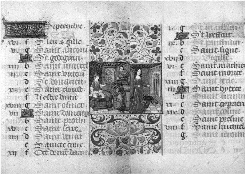
Figure 2. Calendar page for September ( Frick Book of Hours ): two men treading grapes and pouring wine into barrels ( folio 9 recto ); Libra holding the scales of justice ( folio 9 verso ) ( Blackman and Golden 2003 )

read during the eight canonical hours of the day. 8 The Seven Penitential Psalms, the hours of the Cross, the office for the dead, litanies, and more prayers to the Virgin and various saints follow. A book of hours is thus a compilation of diverse materials, little blocks of texts alternating between verse and prose, and cycling through combinations of new and repeated passages. Moreover, books of hours were most frequently bilingual texts, combining Latin and the vernacular, the former being used for prayers, hymns and psalms, the latter for passages of the Scriptures and the illuminations' captions (when present). The juxtaposition of different genres and languages gives to the reading of the book of hours some unique characteristics: the portions in verse and Latin, often repeated across canonical hours, invite attention to and appreciation of the written text's musicality, thereby facilitating sensory attunement and memorization. The vernacular, on the other hand, cues a focus on the text's content, offering suggestions for meditation. 9