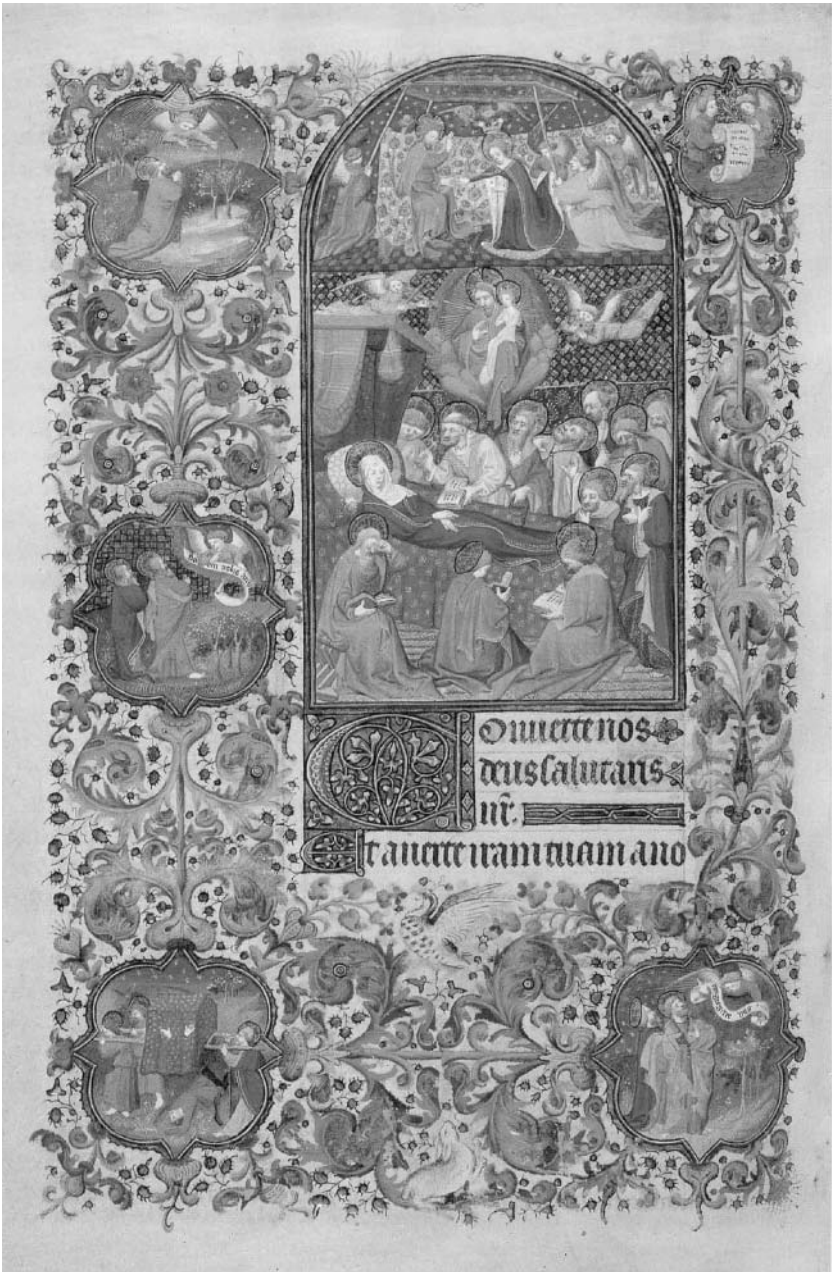
Figure 4. Hours of the Virgin (Compline) (Bedford Hours): the Death of the Virgin, with scenes of the gathering of the Apostles and her funeral (folio 89 v) (Backhouse 1990)