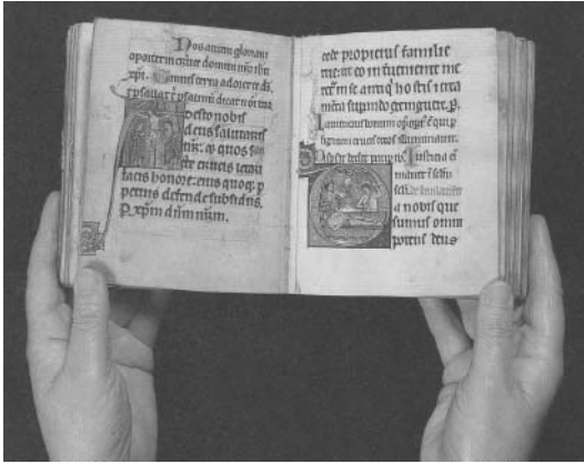
Figure 1. The manuscript (de Brailles Hours) in the hands (Donovan 1991)

The book of hours has usually been considered a daily planner for prayer: it was designed in the manner of the breviary (which pertained exclusively to the clergy), although with fewer textual extracts. Books of hours were typically relatively small in size (Figure 1), 6 so that people could carry them throughout the day in their work and leisure activities. The devout owner was meant to stop eight times a day and read the appropriate section of the book. 7